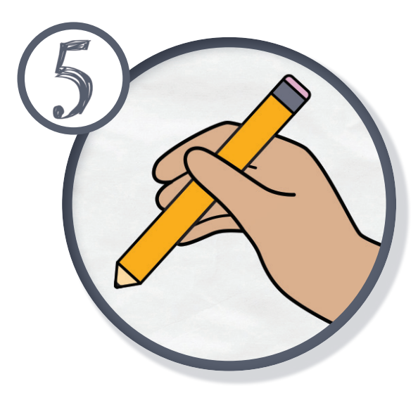
The Dignity of Work and the Rights of Workers