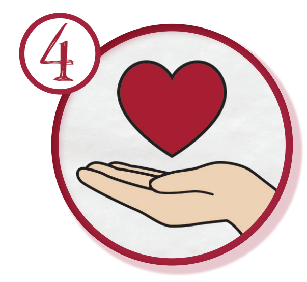
Preferential Option for the Poor and Vulnerable