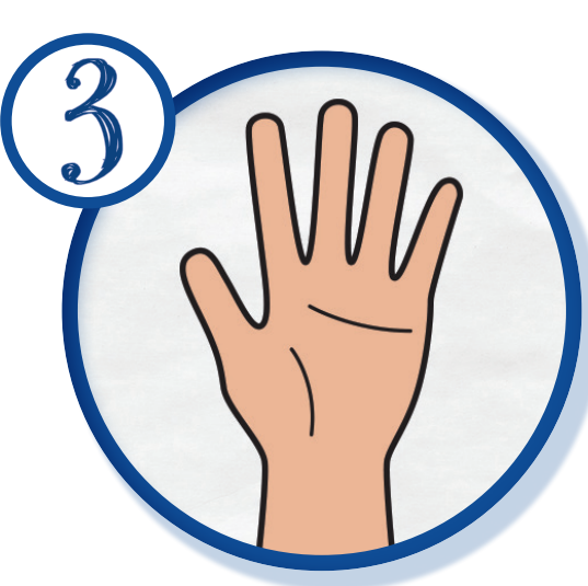
Rights and Responsibilities