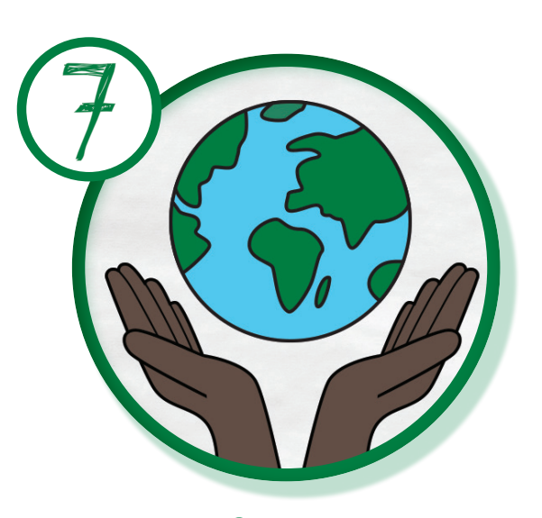
Care for God's Creation