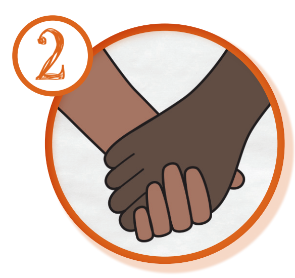
Call to Family, Community, and Participation